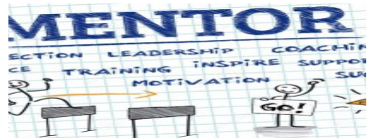
Mentor Professional Learning Units (PLU's) to maintain eligibility to mentor.

three PLU's prior to your mentor expiration date.